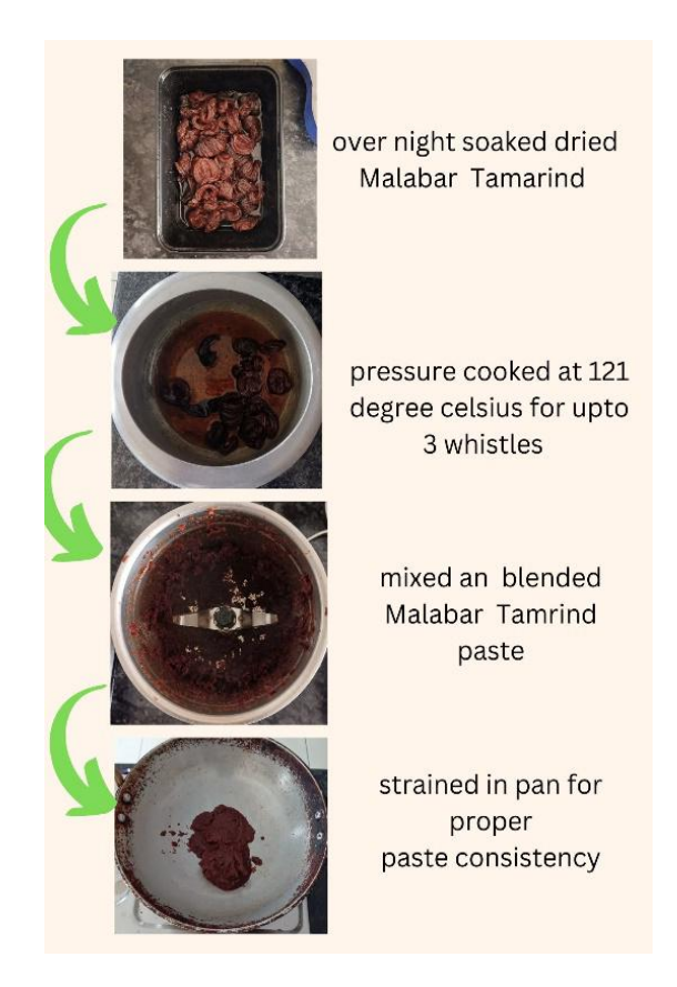
Fig. 3. Representation of malabar tamarind paste preparation

Azhar et al.; Curr. J. Appl. Sci. Technol., vol. 43, no. 12, pp. 81-88, 2024; Article no.CJAST.128101