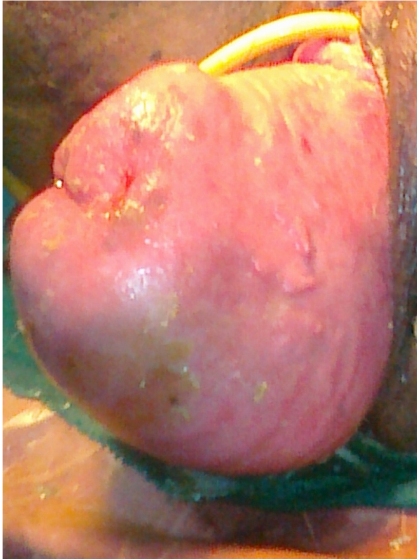
Fig. 1. Incarcerated oedematous congested uterovaginal prolapsed with Foley's catheter in place

isolated pouch of Douglas (POD) collection, mild hydronephrosis and normal bowel. There was no collection in Morrison's pouch or paracolic gutters.